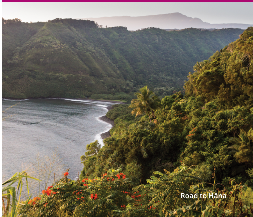
Road to Hāna

Today, Maui reveals its cultural past through a thriving arts scene infused with the life-embracing spirit of aloha . With events at the Maui Arts and Cultural Center and exhibitions at the Hui Noʻeau Visual Arts Center, Maui pays homage to its rich history. Local artisans also expand their influence by creating a wide range of products, from hip fashion to traditional and contemporary crafts.