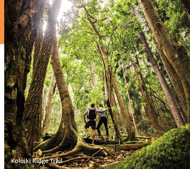
Koloiki Ridge Trail

Lānaʻi offers exceptional snorkeling, scuba diving and more.