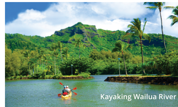
Kayaking Wailua River