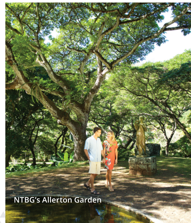
NTBG's Allerton Garden