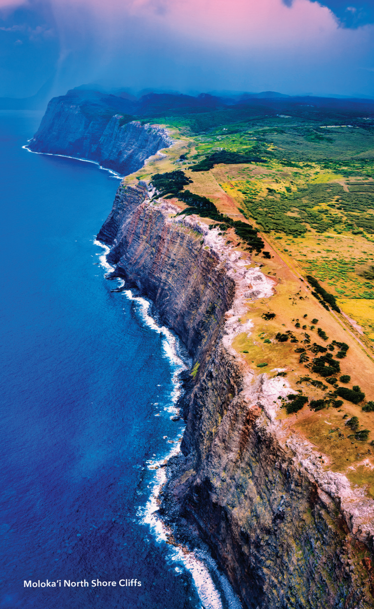
Moloka'i North Shore Cliffs