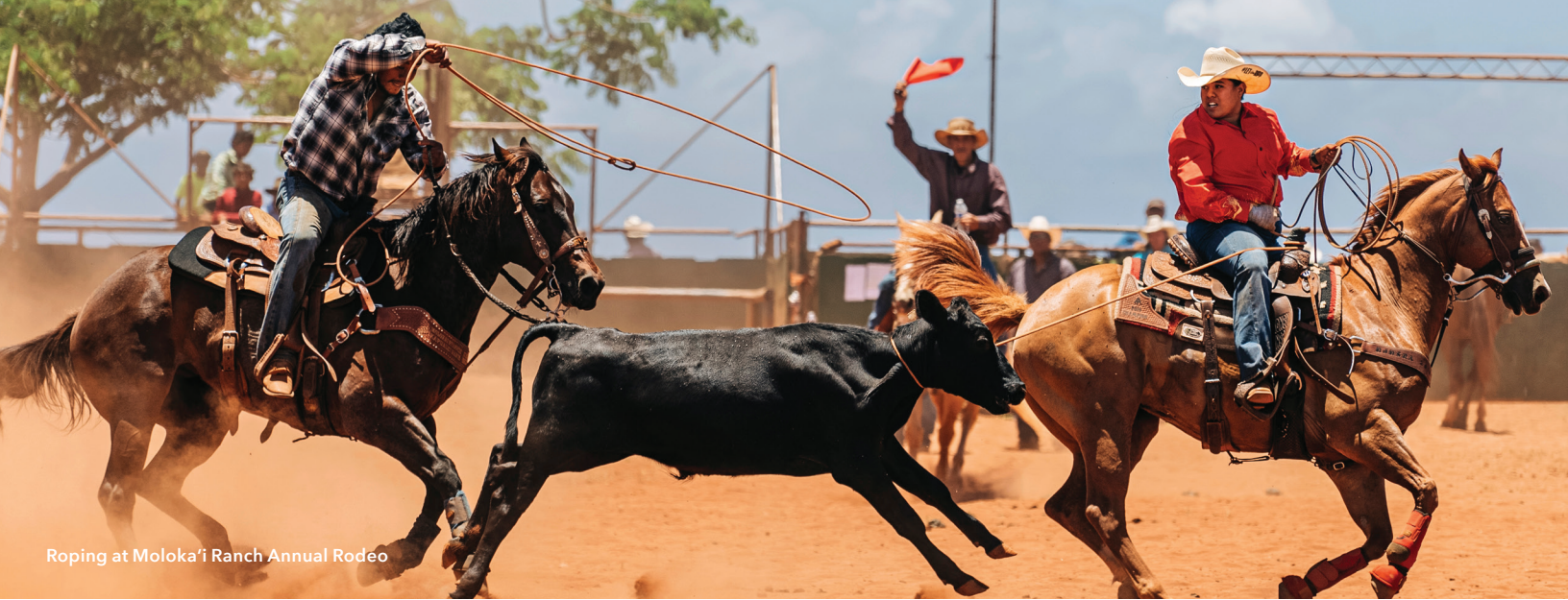
Roping at Moloka'i Ranch Annual Rodeo