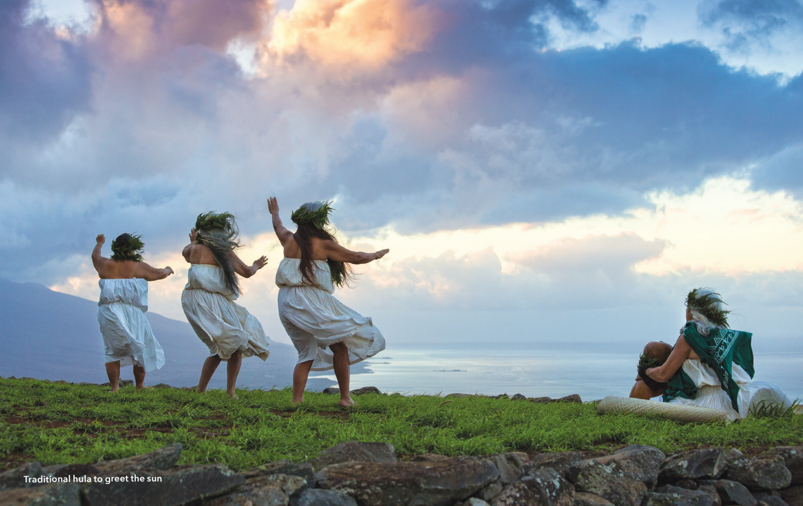
Traditional hula to greet the sun