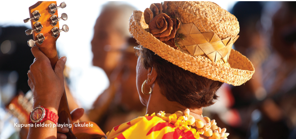
Kupuna (elder) playing 'ukulele