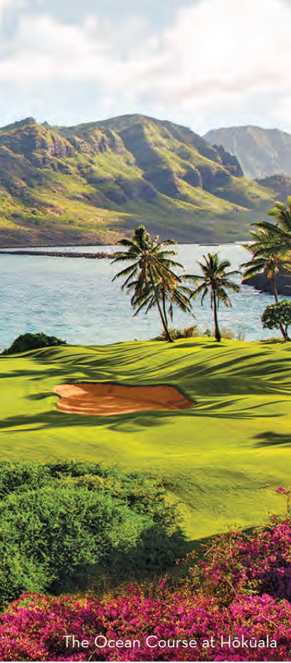
The Ocean Course at Hōkūala