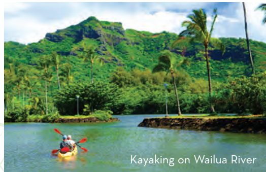
Kayaking on Wailua River