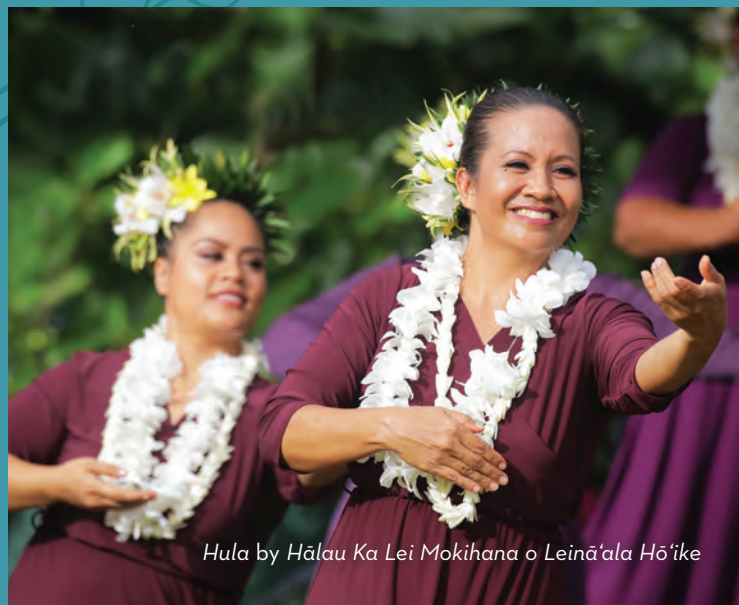
Hula by Hālau Ka Lei Mokihana o Leinā'ala Hō'ike