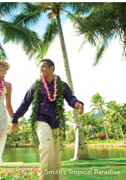
Smith's Tropical Paradise