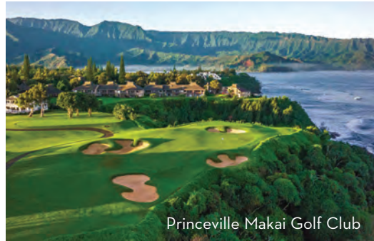
Princeville Makai Golf Club