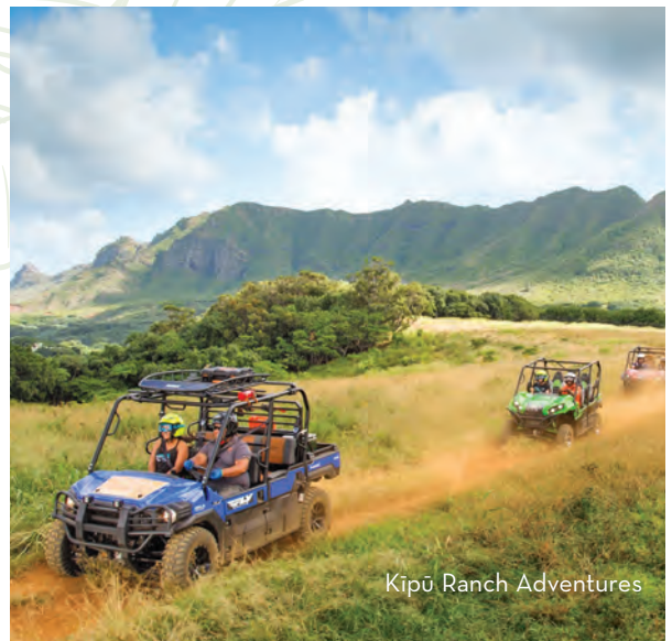
Kipū Ranch Adventures